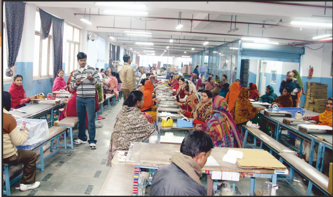
Production and Packaging Team do hard to serve best to our customers.