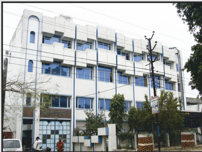
Corporate & Head Office in Varanasi