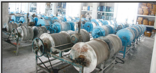
Beads Washing & Polishing Machines