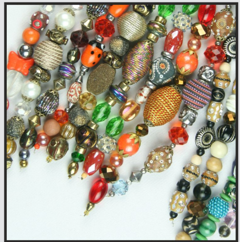
Finished Products from the house of BBL