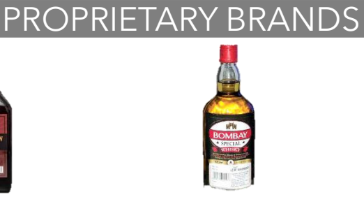
Bombay Special Series