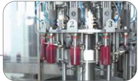
Cold Extracted Juice Bottling