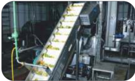
Aseptic Fruit Purees & Concentrates