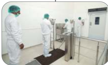
Global Food Safety Standards