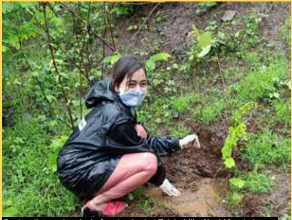
Restoration and revival of watershed at Taloja hills, Navi Mumbai, Maharashtra.