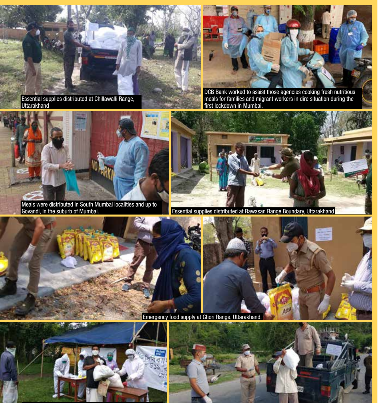
Survival ration and personal hygiene items helped the vulnerable communities fend off hunger in the first wave for Covid-19.

Survival ration distributed at Ramgarh Range Boundary, Uttarakhand.