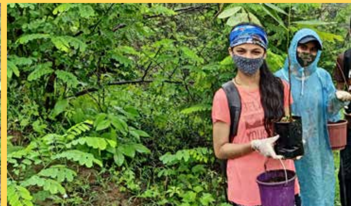
Community volunteers at the watershed project. Using the bounty of monsoon to plant indigenous trees adapted to the landsacpe at Taloja hills, Navi Mumbai, Maharashtra.