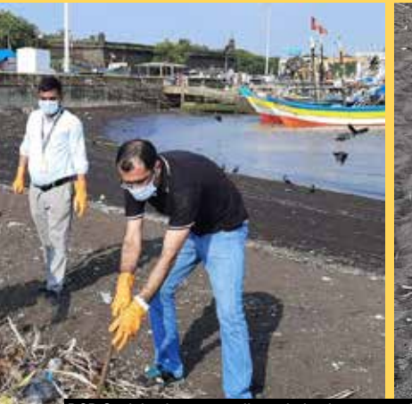
CB Social volunteers collected plastic waste at Daman beach which was taken by the Municipality for disposal.