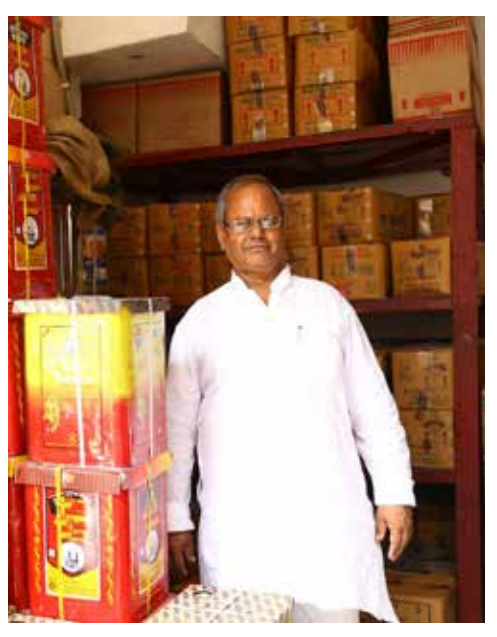
DCB Bank reaches out to customers from 352 branches across India.