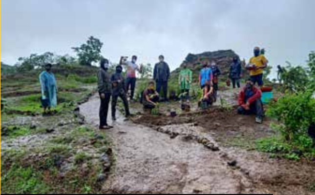
Team getting ready with local tree saplings for plantation. Trees & shrubs are used to slow down the erosion of soil and help absorb water, Taloja hills, Navi Mumbai, Maharashtra.