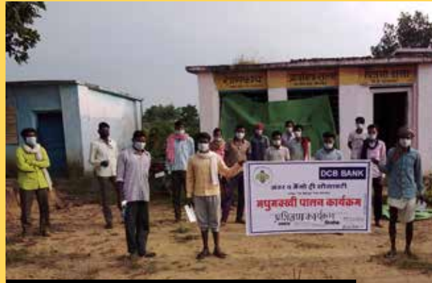
Farmers and beneficiaries participate in a skill and knowledge session conducted by a master trainer for bee keeping, Madhya Pradesh.