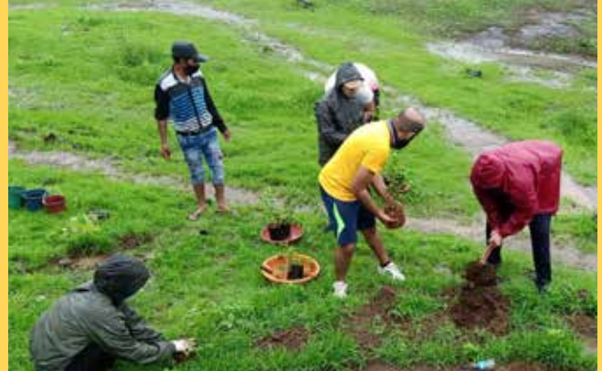
Water absorption trenches with protective shrubs and tree saplings will over the long term help the slopes regain the lost tree cover and recharge the watertable at Taloja hills, Maharashtra.