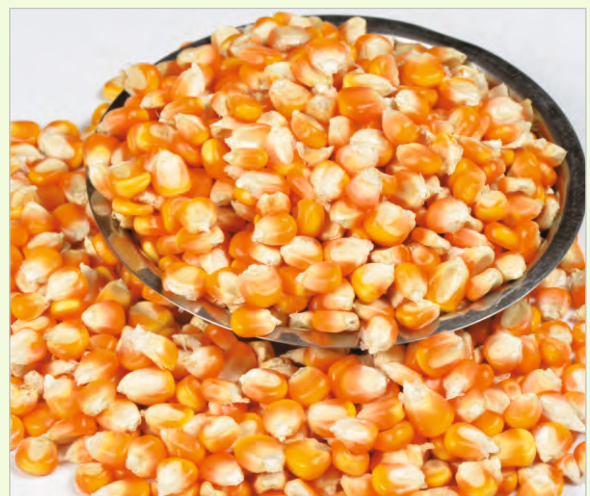
Animal & Poultry Feed