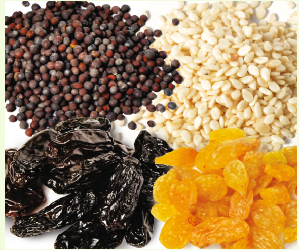
Oil Seeds, Dry Fruits & Nuts