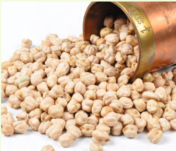
Grains & Pulses