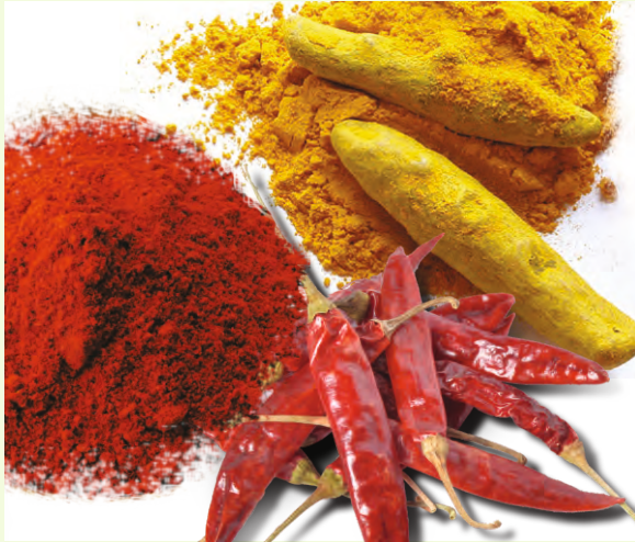
Whole & Ground Spices