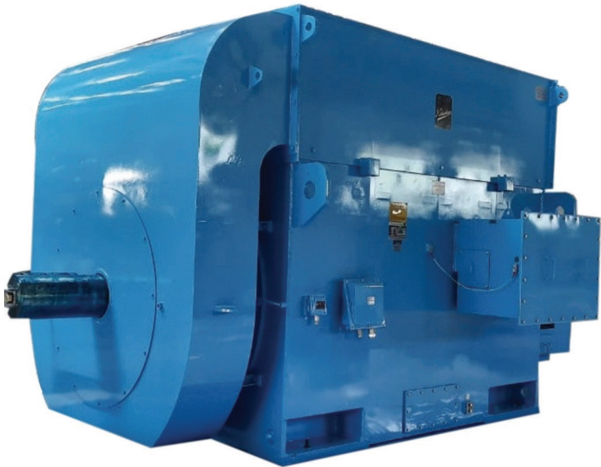
3800kW, 8 Pole, 6.6KV, Motor Wound Rotor Motor in MPA900HW frame supplied to Overseas Customer for ball mill application in Cement Plant.