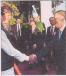
Pakistan PM Imran Khan with Chinese Vice-President Wang Qishan in Islamabad.

Corridor will boost economic integration of region, says Wang Qishan during visit