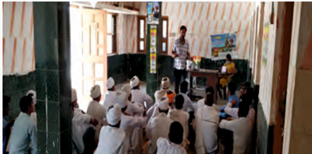
KNOWLEDGE TRANSFER, FARMERS TRAINING PROGRAM