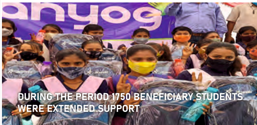
DURING THE PERIOD 1750 BENEFICIARY STUDENTS WERE EXTENDED SUPPORT