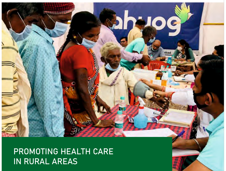
PROMOTING HEALTH CARE IN RURAL AREAS