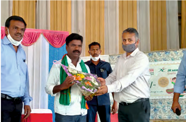
SERVING SMALLHOLDER FARMERS, LIVELIHOOD ENHANCEMENT