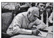
Sibal told reporters in Lucknow. "I resigned from the Congress on May 16 and am no longer a senior Congress leader," he said. Sibal, who has been vocal in his criticism of the Congress leadership, had called for a non-Gandhiist new party chief. "We are all constrained by the fact that we are members of parties and have to abide by the discipline of that party but it is important to have an independent

LUCKNOW/NEW DELHI: Saying that he had resigned from the Congress last week, Kapil Sibal on Wednesday filed his nomination for the Rajya Sabha as an independent candidate from Uttar Pradesh supported by the Samajwadi Party. Sibal, who exited from the Congress is another jolt for the electorally battered party, went to resign from the Congress on May 16 and am no longer a senior Congress leader," he said. Sibal, who has been vocal in his criticism of the Congress leadership, had called for a non-Gandhiist new party chief. "We are all constrained by the fact that we are members of parties and have to abide by the discipline of that party but it is important to have an independent