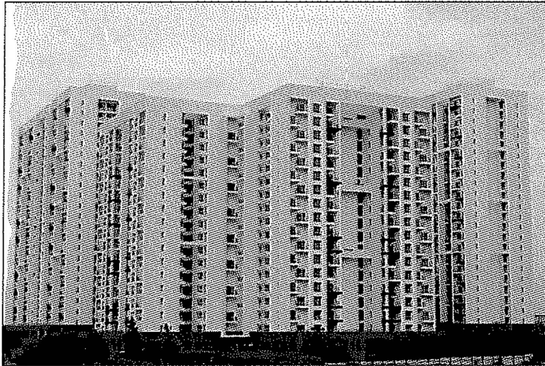
Godrej Infinity, Pune 1.1 million sq. ft.

Delivered 1.4 million sq. ft. across two cities