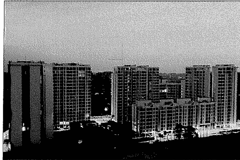
The Trees Phase - 2, Vikhroli 0.28 million sq. ft.