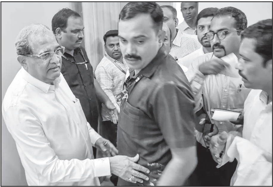
Maharashtra Revenue Minister Radhakrishna Vikhe Patil after turmeric powder attack by a protestor, in Solapur on Friday.

Solapur, Sept 8 : As the Maharashtra government grapples with the Maratha reservations issue, the Dhangars on Friday adopted an aggressive stance for quotas and threw turmeric on a Minister to press for their demands. Senior Bharatiya Janata Party leader and Revenue Minister Radhakrishna Vikhe-Patil was the target of the turmeric attack by two persons at the government guest house, catching his aides and security unawares.Vikhe-Patil was reading a memorandum the duo had handed to him when one of them whipped out a packet of turmeric powder and emptied it on the minister's head and face, even as some others clicked videos which went viral.As the aides and security caught the person, thrashed him and then handed him over to the local police, he was heard raising slogans demanding reservations for the