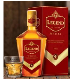
Legend Premium Whisky