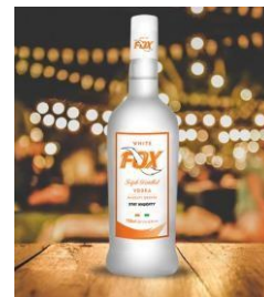
White Fox Triple Distilled Vodka Naughty Green Apple