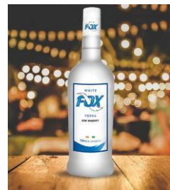
White Fox Triple Distilled Vodka