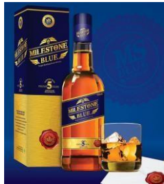
Milestone Blue Whisky