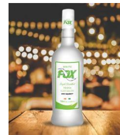
White Fox Triple Distilled Vodka Naughty Orange