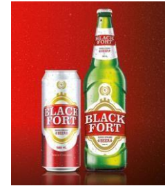
Black Fort Super Strong Beer