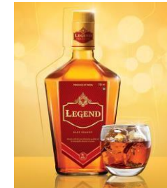
Legend Rare Brandy