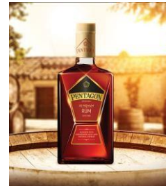
Pentagon XO Premium Rum