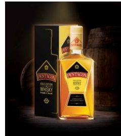
Pentagon Gold Edition Whisky