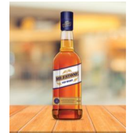
Milestone VSOP Brandy