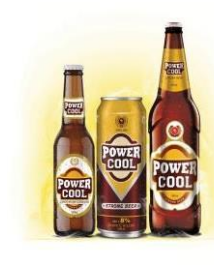
Power Cool Beer