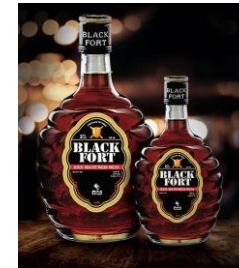
Black Fort XXX Matured Rum