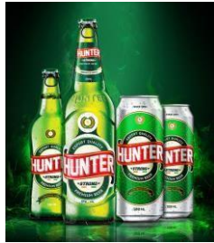
Hunter Refreshing Strong Premium Beer