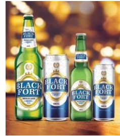
Black Fort Lager Premium Beer