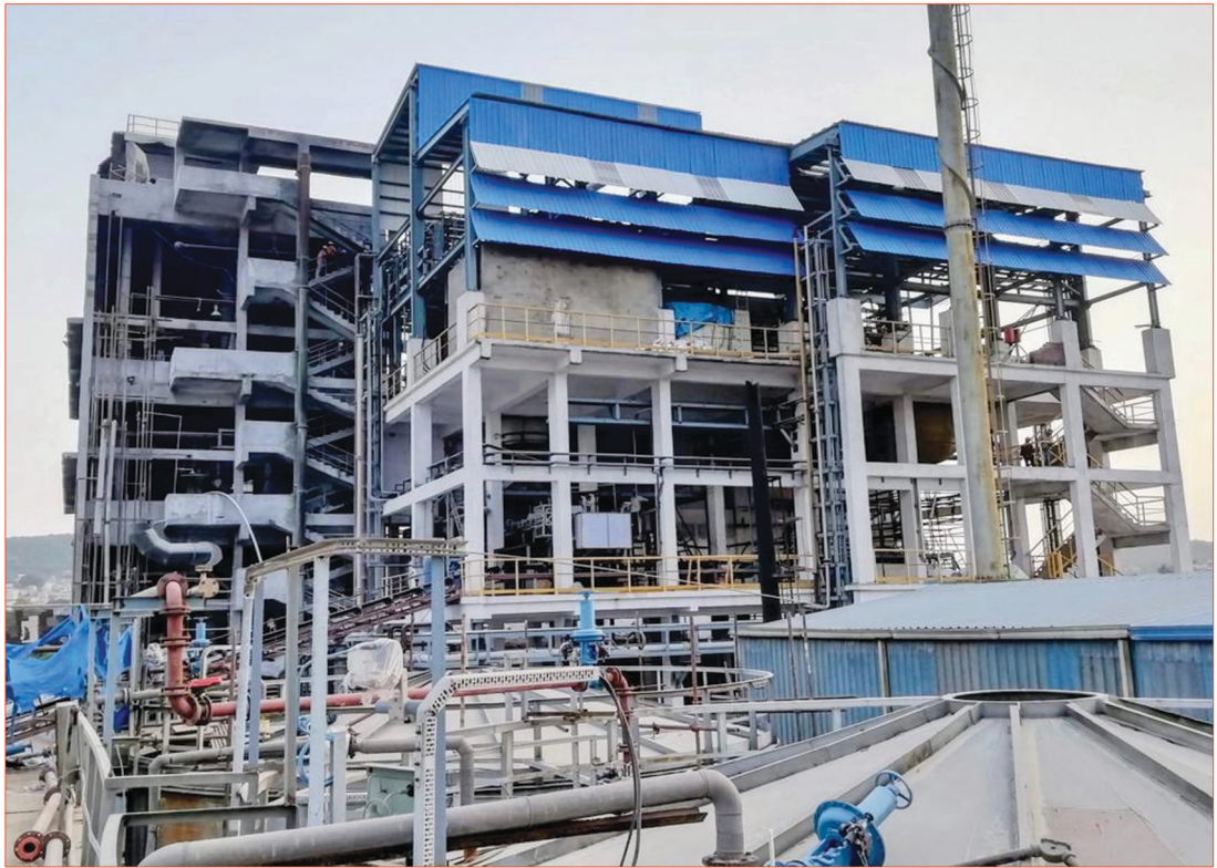
Aluminium Fluoride Plant, Visakhapatnam