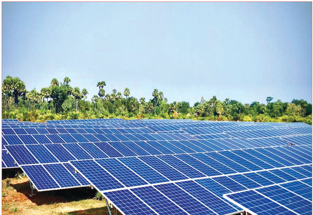
3 MW Solar Power Generation Panels at Polepalli, Visakhapatnam