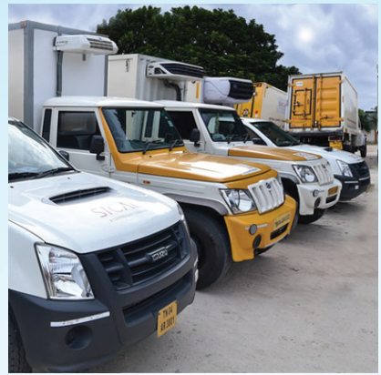
ANNUAL REPORT 2022-23