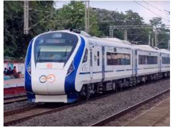
Sunvilla News: Vadodara

While three Vande Bharat Express trains are currently operational in Gujarat, all originating from Ahmedabad, the city of Vadodara is likely to have a Vande Bharat Express train, originating from the city. Railways mulls to operate a new Vande Bharat Express train connecting Vadodara in Gujarat to Pune in Maharashtra. Prior to the final decision on this, a trial run will be conducted between Vadodara and Vasai Road.