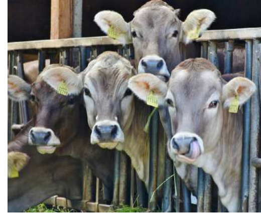
Sunvilla News: Ahmedabad

To alleviate the burden of maintaining these cows, a decision has been made that if any Panjrapole (Gausahala) takes in 750 cows, the facility owners will be compensated with Rs. 7,000 as maintenance costs which was previously Rs. 4,000.