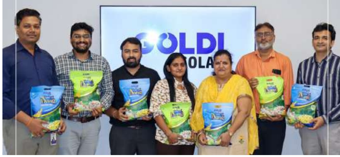
Sunvilla News: Surat