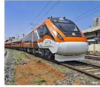
Sunvilla News: Ahmedabad

In order to curb the menace of stray cattle in the city, the cattle control department of the city's civic body is impounding a high number of stray cattle. Consequently, the three cattle ponds managed by the Amdavad Municipal Corporation (AMC) have become overcrowded. To alleviate the burden of maintaining these cows, a decision has been made that if any Panjrapole (Gausahala) takes in 750 cows, the facility owners will be compensated with Rs. 7,000 as maintenance costs which was previously Rs. 4,000. Previously, the AMC