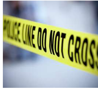
Agency News: Bareilly