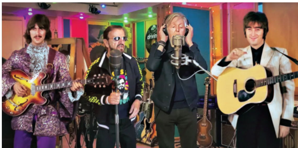
John Lennon (extreme left), who was assassinated in 1980, featured in a new single by The Beatles

John Lennon featured in a new single by The Beatles released less than a month ago. He was killed in December