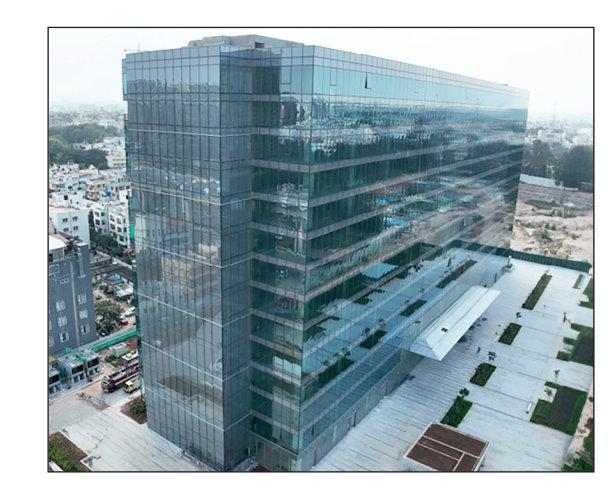
Godrej Centre Hebbal, Bengaluru (0.74 msf)