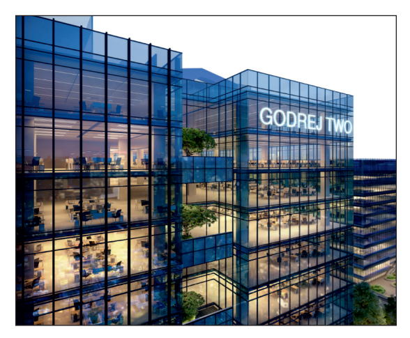
Godrej Two, Mumbai (1.16 msf) - Complete