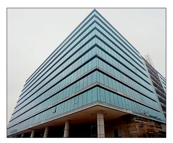
Godrej Centre Indiranagar, Bengaluru (1.05 msf)