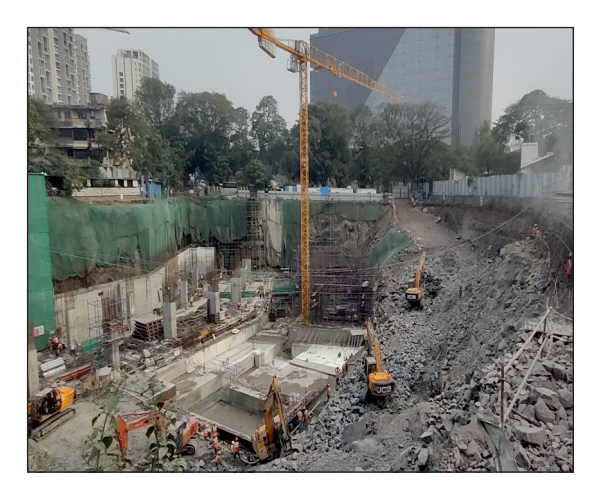
Yerwada, Pune (0.93 msf)