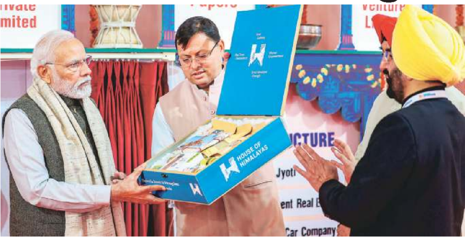
Prime Minister Narendra Modi and Uttarakhand Chief Minister Pushkar Singh Dhami launch the state government's 'House of Himalaya' brand in Dehradun on Friday.