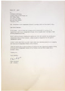
Resignation Letter (1).jpg 249K