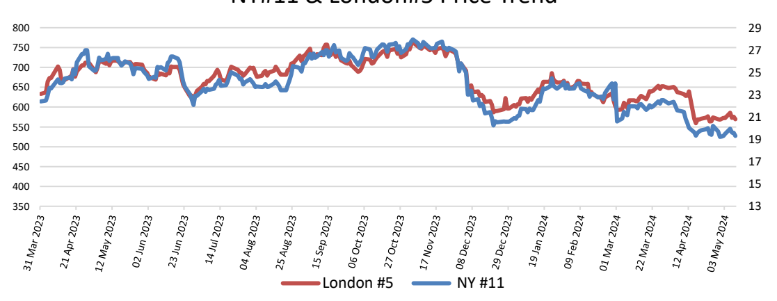
NY#11 & London#5 Price Trend

Note: London #5 on left hand side (LHS) in $/tonne; NY #11 on right hand side (RHS) in US cents/lb