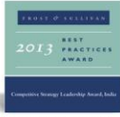
FROST & SULLIVAN 2013 BEST PRACTICES AWARD Corporate Strategy Leadership Award, India