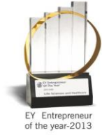
EY Entrepreneur of the year-2013