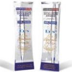
Business today/YES bank Excellence Awards-2013