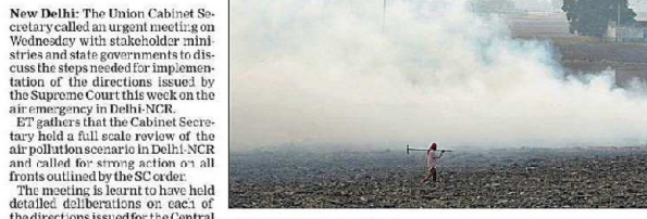
New Delhi: The Union Cabinet Secretary called an urgent meeting on Wednesday with stakeholder ministries and state governments to discuss the steps needed for implementation of the directions issued by the Supreme Court this week on the air emergency in Delhi-NCR.

ET gathers that the Cabinet Secretary held a full scale review of the air pollution scenario in Delhi-NCR and called for strong action on all fronts outlined by the SC order. The meeting is learnt to have held detailed deliberations on each of the directions issued by the central ministries and departments and state governments. Recognizing the pre-eminence of paddy cultivation in Punjab and Haryana leading to burning of huge amounts of paddy straw every year, the Centre will closely be looking at exploring a Minimum Support Price for crops other than paddy. States have been asked to extend ways to phase out paddy cultivation and switch to alternate crops from next year.