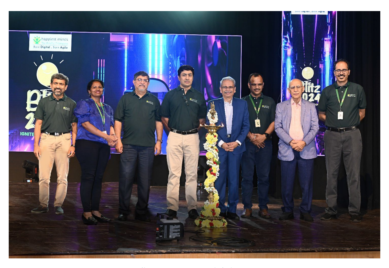
Blitz 2024 - Lamp Lighting ceremony

Bengaluru, Jan 16, 2024 : Happiest Minds Technologies Limited (NSE: HAPPSTMNDS), a 'Born Digital . Born Agile', Mindful IT Company, organized the 7<sup>th</sup> edition of its Annual Tech Fest – Blitz 2024 at St. John's Auditorium, Bengaluru, on Thursday, 11<sup>th</sup> Jan 2024.