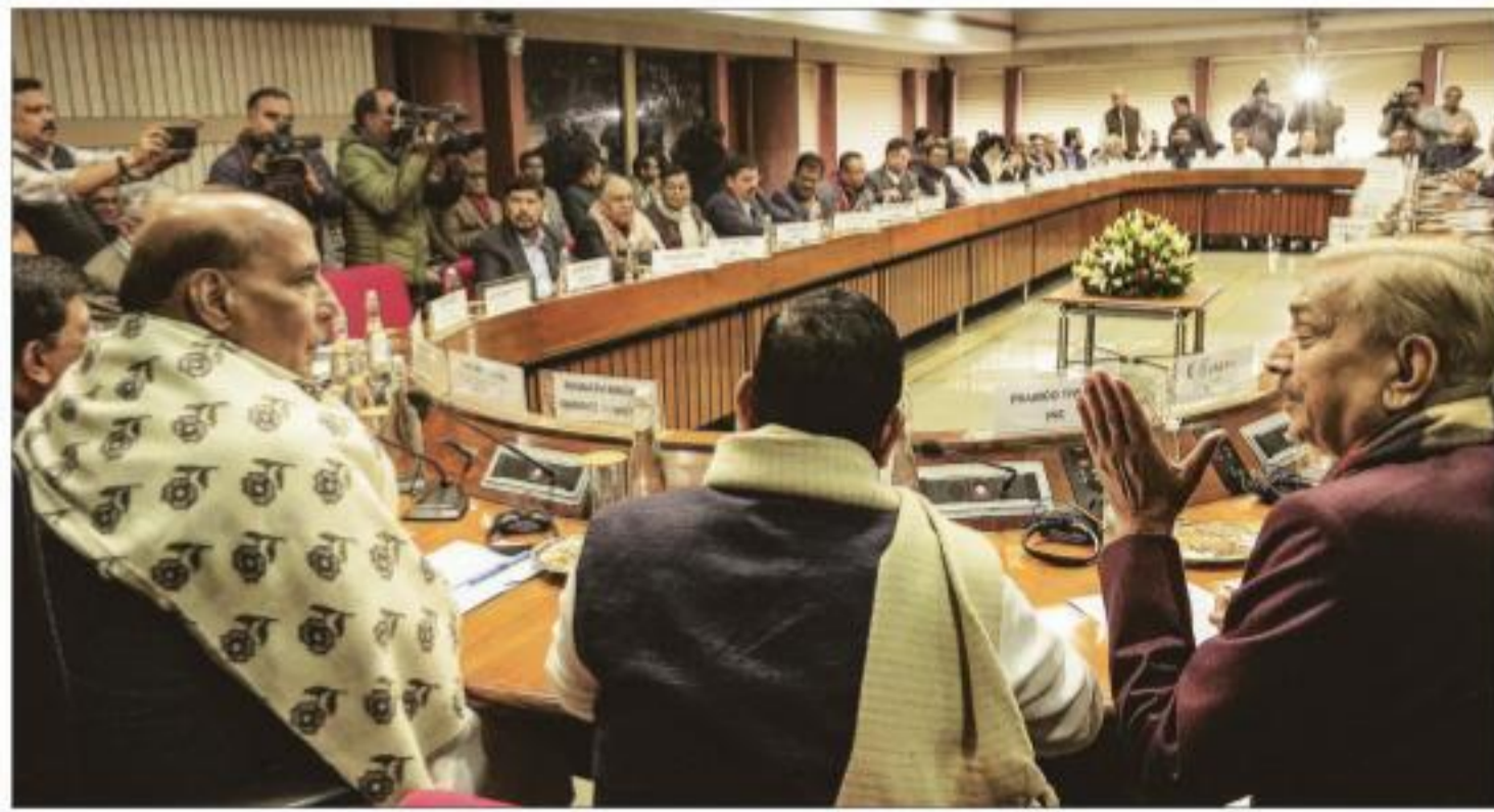
Defence minister Rajnath Singh (left), Congress leader Pramod Tiwari (right) and others during the all-party meeting, in New Delhi on Tuesday

EXPRESS NEWS SERVICE New Delhi, January 30