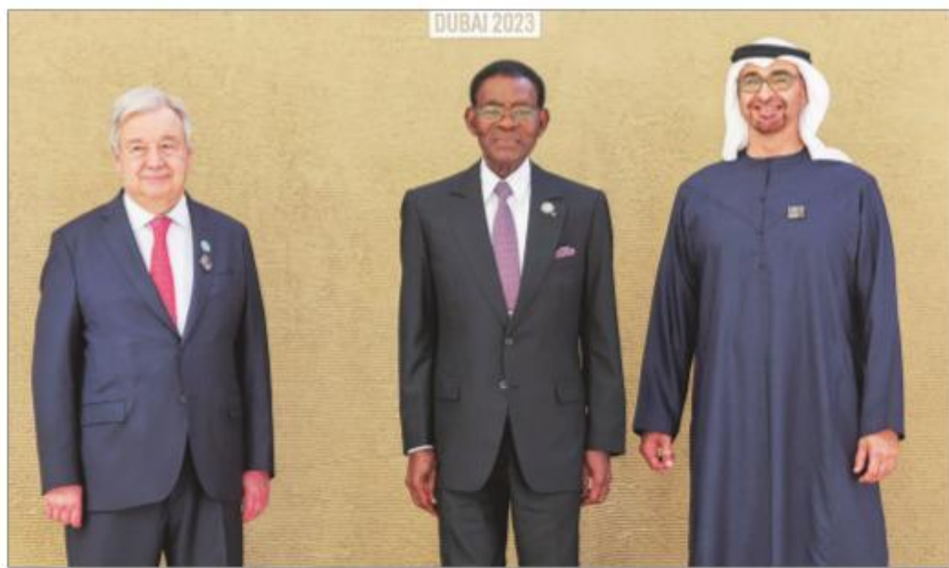
(From left) United Nations Secretary-General Antonio Guterres, President of Equatorial Guinea Teodoro Obiang Nguema Mbasogo and President of the United Arab Emirates Sheikh Mohamed bin Zayed Al Nahyan at the UN Climate Change Conference (COP28) in Dubai

centre stage early Saturday. Several African leaders noted their continent's rainforests help gobble up excess carbon dioxide in the air and emphasised how their countries belch out only a tiny fraction of heat-trapping emissions compared to richer countries.