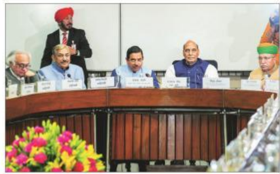
Leaders of the ruling and opposition parties at Parliament House on Saturday

PRESS TRUST OF INDIA New Delhi, December 2