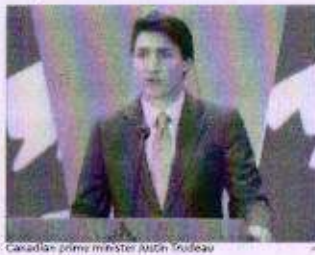
Canadian prime minister Justin Trudeau