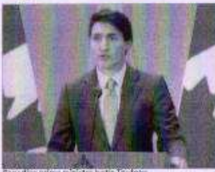
Canadian prime minister Justin Trudeau