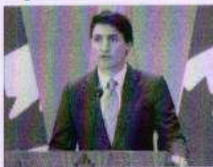
Canadian prime minister Justin Trudeau

DAYS AFTER INDIA asked Canada to reduce its diplomatic presence in the country over the rising diplomatic row over the killing of a Canadian student, Khalistan separatists have now told Ottawa to withdraw 40 of its diplomats to bring parity with the Indian diplomatic presence in Canada. India has about 20 diplomats in Canada, while Canada has three times more than the Indian presence, about 60 diplomats, sources said. They said that the ratio of diplomatic presence in both countries is not in parity. Three days after Canadian Prime Minister Stephen Harper's statement regarding the killing of a Canadian student, Khalistan separatists have now told Ottawa to withdraw 40 of its diplomats to bring parity with the Indian diplomatic presence in Canada. India has about 20 diplomats in Canada, while Canada has three times more than the Indian presence, about 60 diplomats, sources said. They said that the ratio of diplomatic presence in both countries is not in parity.