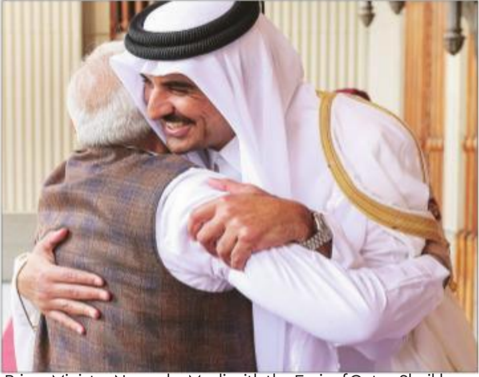
Prime Minister Narendra Modi with the Emir of Qatar, Sheikh Tamim bin Hamad Al-Thani, in Doha on Thursday.

Modi, who was accorded a ceremonial welcome at the Amiri Palace in Doha, held wide-ranging talks with the Emir including on "economic cooperation, investments, energy partnership, space collaboration, urban infrastructure, cultural bonds and people-to-people ties," the Ministry of External Affairs (MEA) said in a statement. "The two leaders also exchanged views on regional and global issues," it said.