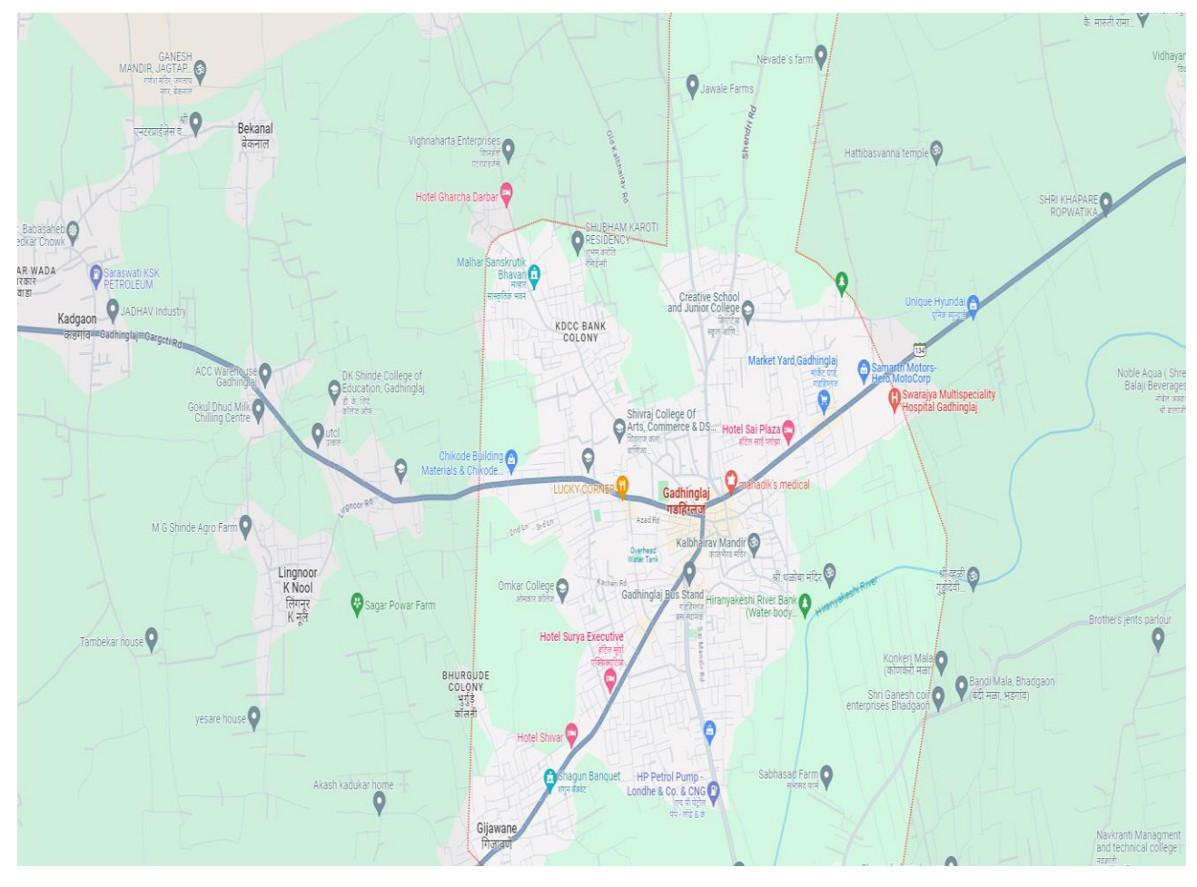
MAP SURVEY NO. 990, BERAWADI, TALUKA GADHINGLA, KOLHAPUR -416502