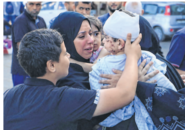
A woman holds an injured toddler following Israeli bombardment of Deir Balah in the central Gaza Strip

Northern Gaza is facing a severe water shortage, as there is no fuel to pump from municipal wells and Israel shut off the region's