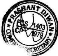
PRASHANT DIWAN SCRUTINIZER