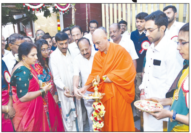
25 ವರ್ಷಗಳಲ್ಲಿ ಡಾ. ಬಾಲಗಂಗಾಧರನಾಥ ಸ್ವಾಮೀಜಿ ಅವರು ಶಾಲೆಗೆ ಭೇಟಿ ನೀಡಿ ಆಶೀರ್ವಚನ ನೀಡಿದ ಫಲವೆಂದಾಗಿದೆ ಎಂದು ಶಿಕ್ಷಕರ ಕಾರ್ಯ ವೈಖರಿ ಬಗ್ಗೆ ಮೆಚ್ಚುಗೆ ವ್ಯಕ್ತಪಡಿಸಿದರು.

ಕೆಂಗೇರಿ,ಫೆ.14:ಜಾತಿ ಮತ ಪಂಥಗಳ ಎಲ್ಲೆ ಮೀರಿ ಮಾನವೀಯ ಮೌಲ್ಯಗಳನ್ನು ರೂಢಿಸಿಕೊಂಡು ನಿರ್ಮಾಣ ಸೇವೆ ಮೂಲಕ ದೇಶ ಹಾಗೂ ಶೈಕ್ಷಣಿಕ ಪ್ರಗತಿಗೆ ಕೊಡುಗೆ ನೀಡಿದ ಶಿಕ್ಷಕರ ವೃತ್ತಿಪರತೆ, ಸಾಮಾಜಿಕ ಚಿಂತನೆ ಹಾಗೂ ಕಾರ್ಯ ಶ್ರೇಷ್ಠತೆ ಸ್ಮರಣೀಯವಾಗಿದೆ ಎಂದು ಅಧಿಕಾರಿಗಳಿಗೆ ಮಹಾಸಂಸ್ಥಾನಮಠದ ಸೀತಾಧಿಪತಿಗಳಾದ ಡಾ. ನಿರ್ಮಲಾನಂದನಾಥಮಹಾಸ್ವಾಮಿಯವರು ಶಿಕ್ಷಕರ ಕಾರ್ಯ ವೈಖರಿ ಬಗ್ಗೆ ಮೆಚ್ಚುಗೆ ವ್ಯಕ್ತಪಡಿಸಿದರು.