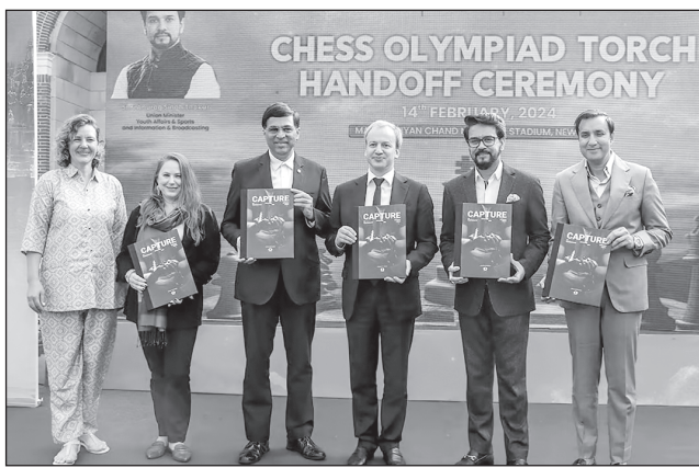
Union Minister Anurag Thakur, FIDE President Arkady Dvorkovich, chess legend Viswanathan Anand and Hungarian chess legend Judit Polgar during Olympiad Torch hand-off ceremony & FIDE's 100th anniversary celebration at Major Dhyan Chand National Stadium, in New Delhi on Wednesday.