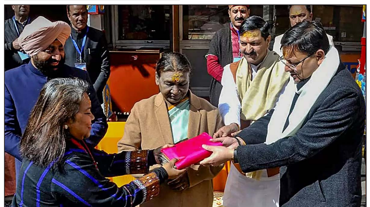
President Droupadi Murmu being felicitated by Uttarakhand Governor Lt General Gurmit Singh, Chief Minister Pushkar Singh Dhama and others during her visit to the Badrinath Temple, in Chamoli district.