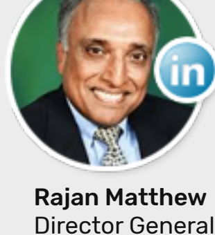
Director General, Cellular Operators Association of India (COAI)