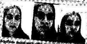
సెల్ఫీ తీయడానికి వాటిని వేస్తే అందంగా కనిపించదు.

ప్రస్తుతం ట్రెండ్ అలాగా సెల్ఫీ తీయడం మొదలైంది. ఈ సెల్ఫీ తీయడానికి వాటిని వేస్తే అందంగా కనిపించదు. వాటిని వేస్తే అందంగా కనిపించదు. వాటిని వేస్తే అందంగా కనిపించదు.