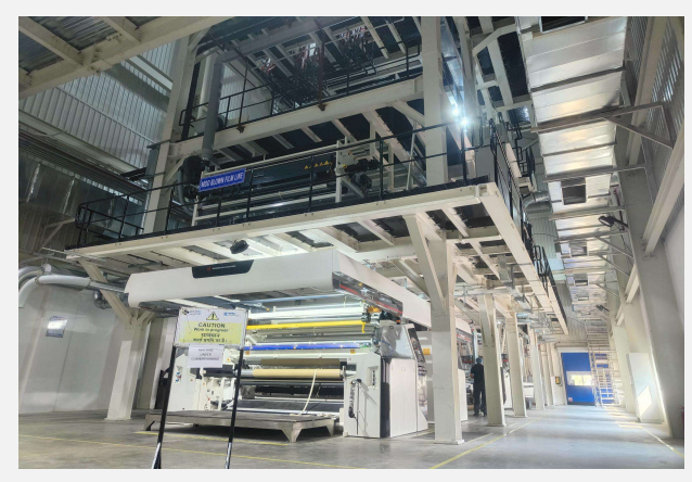
5 Layer MDO Line