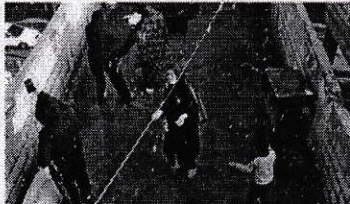
Palestinians enjoy the snowfall in Rafah on the southern Gaza Strip on Thursday.

"A military operation into Rafah would be catastrophic," the statement by the prime ministers of the three countries said, as reported by Reuters. "An immediate humanitarian ceasefire is urgently needed."