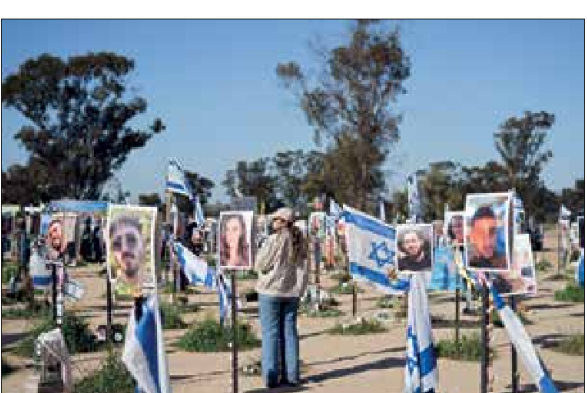
Israeli PM Netanyahu in public denies there is any such dilemma

JERUSALEM: Over the last five months, Israel has killed thousands of Hamas fighters, destroyed dozens of their tunnels and wreaked unprecedented destruction on the Gaza Strip.