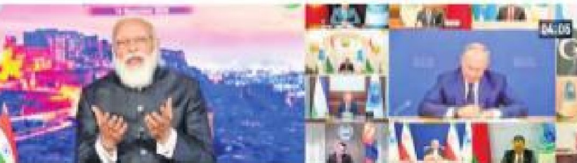
PM Narendra Modi addressing the 20th SCO summit, via video conferencing, in New Delhi on Tuesday

In a stern message to China and Pakistan, Prime Minister Narendra Modi while addressing the SCO summit on Tuesday said there should be respect for each others' sovereignty and territorial integrity. In his speech at the eight-member Shanghai Cooperation Organisation (SCO) summit, held virtually, Modi also hit out at those making repeated attempts to "unnecessarily" bring bilateral issues to the SCO in violation of the bloc's foundational principles, in an oblique reference to Pakistan raising the Kashmir issue in its past meetings. The remarks by Modi came in the backdrop of the Sino-India border row in eastern Ladakh and Chi-