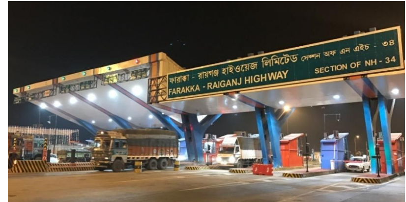
Farakka Raiganj Highway: Toll Plaza at Km 297