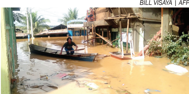
A resident paddles a wooden boat around houses surrounded by floodwaters in the town of Ilagan in Isabela province, north of Manila on Saturday two days after Typhoon Vamco hit parts of the country bringing heavy rains and flooding.

The death toll from typhoon Vamco that battered the Philippines earlier this week has increased to 53, the police said on Saturday.