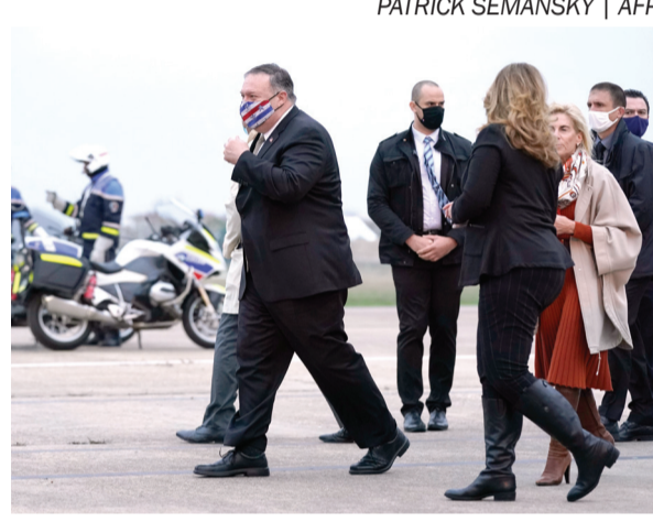
US Secretary of State Mike Pompeo walks to a motorcade vehicle after stepping off a plane at Paris Le Bourget Airport on Saturday in Le Bourget.

French Foreign Minister Jean-Yves Le Drian noted on Friday the "difficult subjects" on the table, from the situation in Iraq and Iran, terrorism, the Middle East