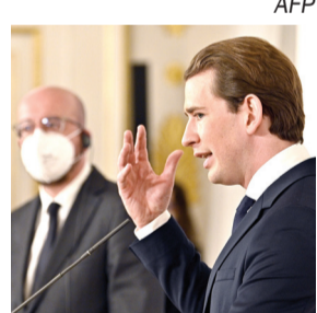
Austrian Chancellor Sebastian Kurz

The entire continent has suffered Muslim fundamentalists for decades, their cantankerousness and vehemence growing over the years. Till some time ago, anybody standing up to them was vilified by the mainstream media