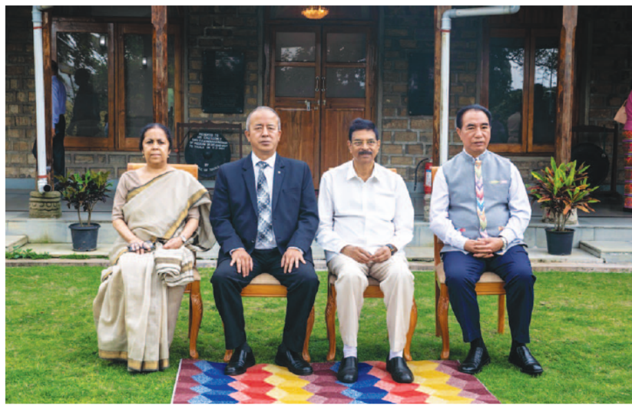
Department of Personnel & Administrative Reforms. The variety and progressive nature of his postings suggest a well-rounded and capable officer who has been entrusted with key responsibilities by the Mizoram government. Before he was appointed Chairman of MPSC, he held the post of Secretary, General Administration Department & Public Works Department.