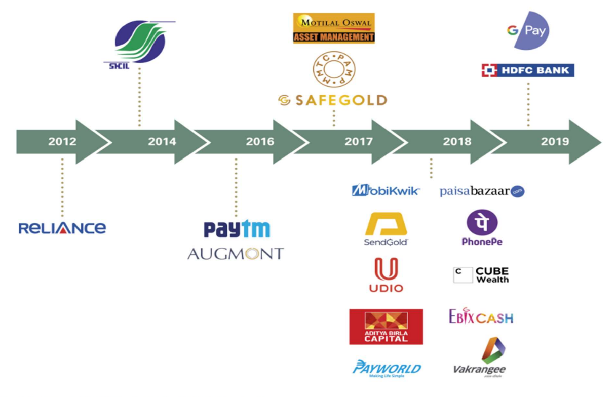
Figure 1: Timeline for launch of digital gold platforms in India