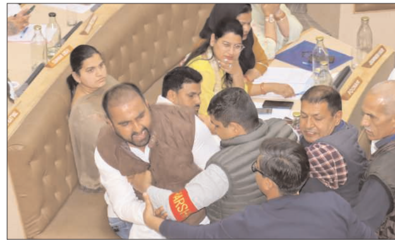
चंडीगढ़ नगर निगम में हंगामा कर रहे पार्षदों को बाहर ले जाने का प्रयास करते सुरक्षाकर्मी।