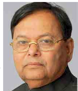
डॉ. पतंगराव कदम

भारतीय स्वातंत्र्याला ७७ वर्षे पूर्ण झाली आहेत आणि भारतीय प्रजासत्ताकाला ७५ वर्षे पूर्ण होत आहेत. देशाच्या प्रागतीकडे चाललेल्या वाटचालीत ज्या संस्थांचा वाटा आहे, त्यात 'भारती विद्यापीठ'चे योगदानही उल्लेखनीय आहे. संयुक्त महाराष्ट्राच्या निर्मितीनंतर शिक्षण, सहकार, राजकारण आणि समाजकारण या क्षेत्रांत राबत्याचे ज्येष्ठ नेते, माजी मंत्री आणि भारती विद्यापीठाचे संस्थापक-कुलपती डॉ. पतंगराव कदम यांनी कर्तृत्वाची ठसठसती नाममुद्रा उमटवली. त्यांचा जन्म सांगली जिल्ह्यातील दुष्काळग्रस्त भागातील ८०० लोकसंख्या असलेल्या सोमसद या छोट्या खेड्यात सामान्य शेतकरी कुटुंबात झाला. कुंडल येथील नाना पाटील बोडिंगमध्ये राहून त्यांनी माध्यमिक शिक्षण घेतले. रयत शिक्षण संस्थेच्या सातारा येथील छत्रपती शिवाजी कॉलेजमधून 'कमना