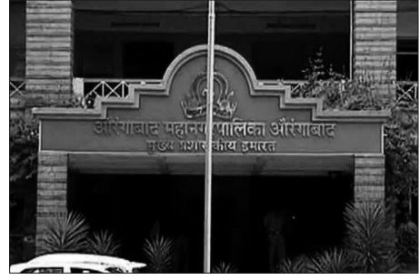
औरंगाबाद पालिका निवडणूक