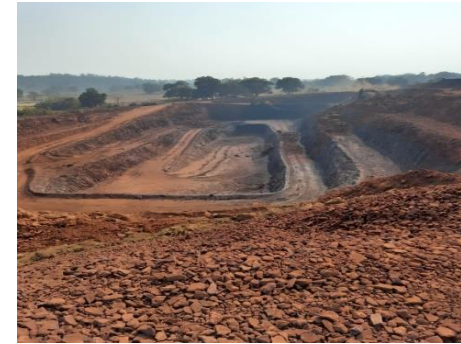
Captive Iron Ore Mine in Odisha