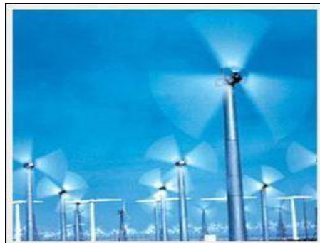
6 MW Windmill unit at Tamil Nadu