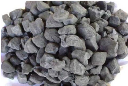
SPONGE IRON DRI