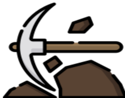
Strategically located in major mineral belt of the Country