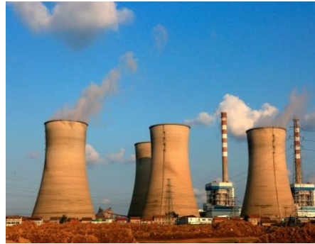
245 MW Captive Power Plant in Chhattisgarh