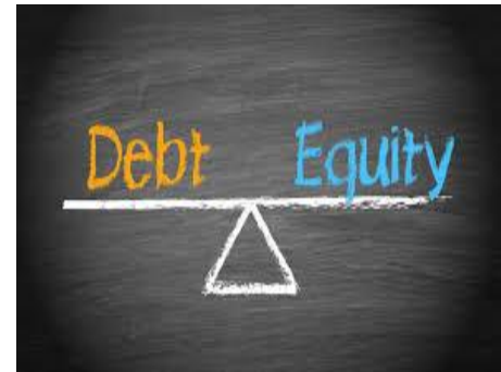
One of the lowest leveraged Company in the industry