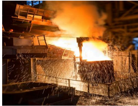
1.2 Mn TPA Integrated Steel Plant in Chhattisgarh