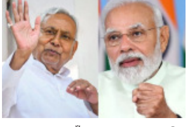
ନାତୀଶ କୁମାରଙ୍କ ବୟାନ ଉପରେ ବିରୋଧୀ ଦଳଗୁଡ଼ିକ ରୁପ ରହିବା ନେଇ ମୋଦି ପ୍ରଶ୍ନ କରିଛନ୍ତି ।