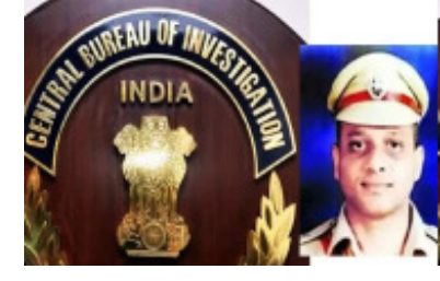
ସିବିଆଇରେ ଯୁଗ୍ମ ନିର୍ଦ୍ଦେଶକ ପଦରେ ନିଯୁକ୍ତ ହେଇଛନ୍ତି ଭି.ଚନ୍ଦ୍ରଶେଖର ।

କାର୍ଯ୍ୟରତ ଅଛନ୍ତି । ନିକଟରେ ସୁରତର କଡ଼ୋଦ୍ଧାର ଅପହରଣ ମାମଲାରେ ଯାଞ୍ଚ ତାଙ୍କ ନେତୃତ୍ୱରେ ହେଉଥିଲା ।