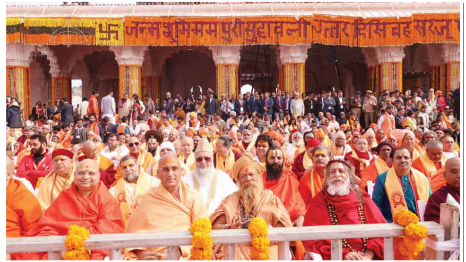
Saints and seers at the Shri Ram Temple consecration in Ayodhya on Monday

Ayodhya: As a festive spirit prevailed in Ayodhya, there was an emotional outpouring among residents of the holy city as the consecration of the new idol of Ram Lalla was held on Monday and said they