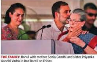
THE FAMILY: Rahul with mother Sonia Gandhi and sister Priyanka Gandhi Vadra in Rae Bareilly on Friday

Amethi and Rae Bareilly if the INDIA bloc forms the next govt. "If Rs 10 is spent for development work in Rae Bareilly, it would be the same for Amethi too... this is my promise," he added.